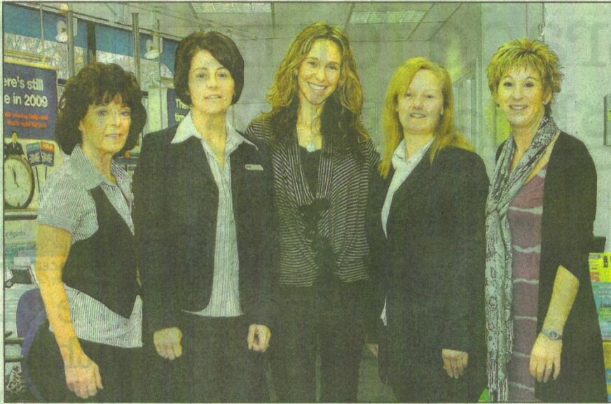
MIDAS TOUCH: All that glitters is gold for this party season

EACH week, real puts the latest beauty products to the test using our very own jury made up of real women. This week, we asked the girls from Halifax Estate Agents in Waterloo to shimmer and shine in some of the latest looks in gold